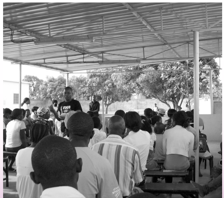
Health Education in the clinic in Viana.