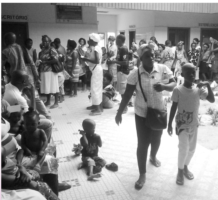
A busy day in Viana.

It is a very busy health center and saw 8,491 new patients in 2018 with 11,469 repeat visits. 2,604 women