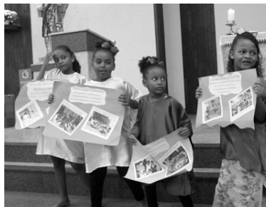
Telling the story of MMM in Brazil.