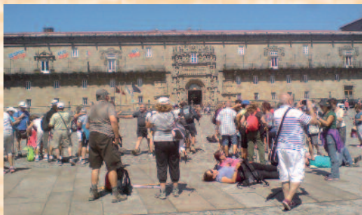
Pilgrims gather in the Cathedral square.

"There had been an extraordinary revival of interest in the medieval pilgrimage route across Spain in the last thirty years. It is estimated that each year over 100,000 people take part on foot, by bicycle, and even on horseback. Pilgrims come from all nations and backgrounds and for many different motives. Some are searching for meaning in life. Some seek spiritual redemption. Others are just interested in a good long walk!