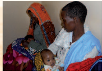
Waiting for vaccination

"On 20 January we set out for Masusu from Nangwa, after a phone call to the village leader assured us that the road was passable. We used four-wheel drive in four different places, but arrived safely after two hours. Some mothers and children were waiting and the village chairman welcomed us. More people came and we began the clinic with health education. One hundred and forty-two children were weighed and vaccinated as needed. We saw the pregnant women in a locally-built mud house. Two wooden beds with rope mattresses were provided for examining the sixty-five women. The roof of the house had started to leak.