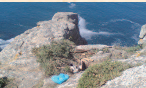
Cape Finisterre: "End of the world"

"The Cathedral of Santiago was not the final stop for all. Many continued to one of the westernmost points of mainland Europe, Cape Finisterre (Latin for 'end of the world'), a small piece of land jutting out into the Atlantic. I walked this part of the journey. The cliff top is marked with a cross and a pair of worn out boots. It is awe-inspiring and a great way to contemplate the completed journey. I felt privileged for the opportunity to participate even for a short while, to be with the people who have walked and