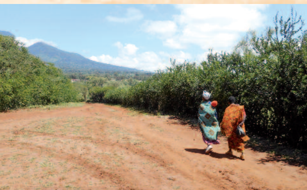
Mothers made their way to the clinic on foot.