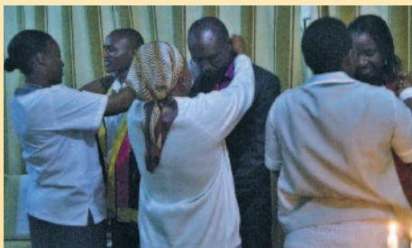
The three new MMM Associates receive their emblems.