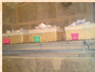
Petitions left by pilgrims

"The pilgrims greatly appreciated the Chaplaincy service, for the place and time they were given so they could begin the process of understanding what had occurred to them on the journey. I met a number of people who return every year to continue parts of the route. People were also offered the opportunity to write down their personal intentions. These were placed in a basket and remembered each day in the Eucharist and daily liturgy.