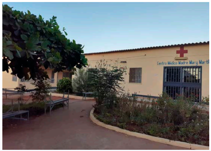
SR. JOYCE ZARNIK, OSF

Crime and violence are the order of the day here. There are many dangerous gangs that, apart from terrorizing the communities, fight among themselves sometimes causing harm to anyone near at the time. We, the MMMs, have fallen victim to this violence and terror as we experienced in the early hours of the September 27, 2021. Our house was robbed by a large group. It was a terrible and traumatic experience as we were tied up, gagged, and locked in a closet. We are gradually recovering from the trauma and are aware that our healing will take some time.