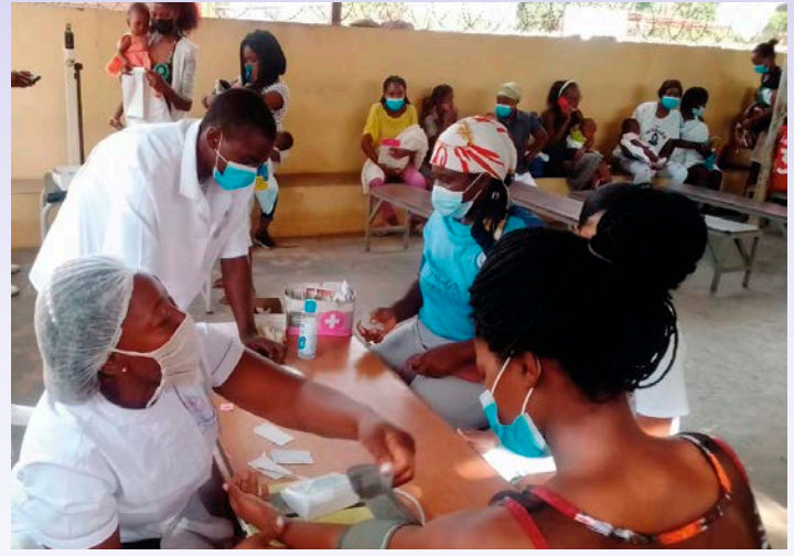
The waiting room at the Medical Center

Again, on December 21, 2021, we had another attempted robbery, but this time the leader of the group was caught by our able security man. We had contracted a new and better security company after the robbery in September. The company is expensive but good. The reality is we have to pay for 24-hour security to remain in this area.