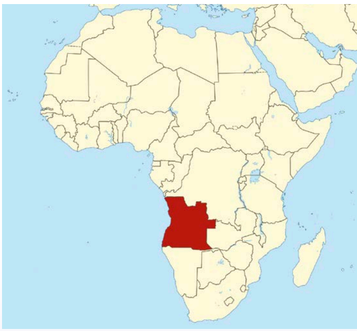
Angola, West Africa

Viana is a municipality in the province of Luanda, which is also the name of the capital of the country. The Medical Missionaries of Mary have a Health Centre here that serves not only the people in this area, but people from far and wide. The attraction is that the clinic is managed by the MMMs, and we give holistic care, using our Core Values that we share with our staff. They in turn implant these values in their care of the patients both in our clinic and in the wider community in their homes. Somehow, though people coming to the clinic would not understand the term “core values,” they seem to find that they are treated with respect and welcomed and those are two of our core values! (The MMM Core values that we have agreed to practice as best as we can are Commitment, Compassion, Creative Fidelity, Hospitality, Interconnectedness, and Integrity.)