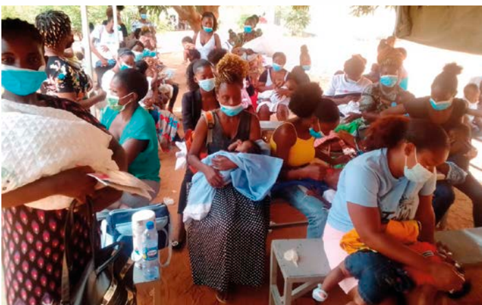
An ante-natal clinic outside the medical center

The work in Viana is challenging but it is valuable and seeing how we are able to support and help the people here keeps us going. We are also aware that so many people in both the USA and Ireland are praying for us, supporting us financially, and this is a good opportunity to let you know how grateful we are. Thank you.