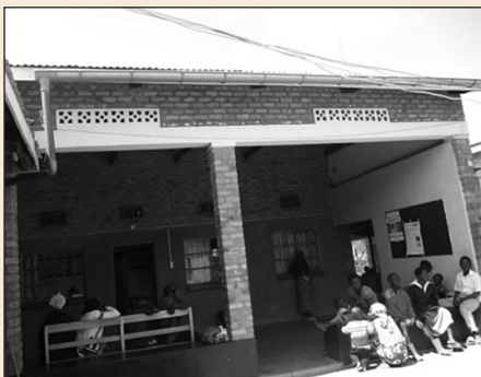
Patients waiting for tests.

We first went into Rwanda in June 1994 in response to the genocide that had occurred and were involved in relief work until June 1995. We returned in October 1996 and in May 1997 we took over the running of the Kirambi Health Center at the request of the Bishop of Gikongoro Diocese. The Center serves two outreaches namely Kirambi and Kabilizi in the Southern Province of Rwanda with a combined population of approximately 25,000 people.