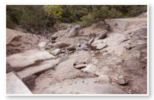
Tanzania sand dams local terrain

water is stored, it seeps out of the sand. Then a well is built so people can access the water. Sand storage dams also have several important advantages over other surface water sources.