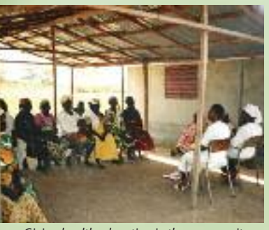
Giving health education in the community

Another challenge was the waiting time at the clinic, causing overcrowding and tension among patients, families and staff. The average was 4 hours but could extend to 6 hours in an emergency. This was difficult for staff, who spent large amounts of time 'keeping the peace'.