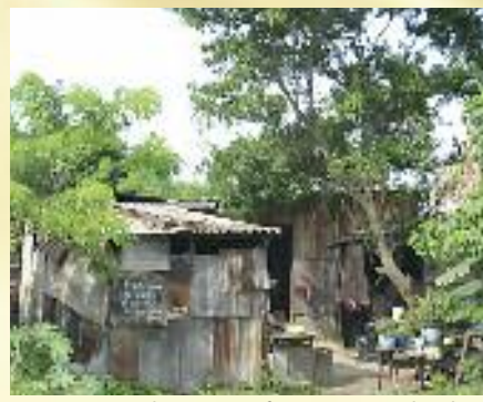
Homes in rural areas are often constructed with poor materials.

Photojournalist Encarni Pindado travelled to San Pedro Sula, the country's second city and industrial centre to see the damage. Our Sisters in Choloma are based in this area. Mr. Pindado commented, 'Official figures suggest more than 150,000 people have been left homeless due to the damage caused by the two storms. Entire families are camping out wherever they can, even if it means sleeping rough by the side