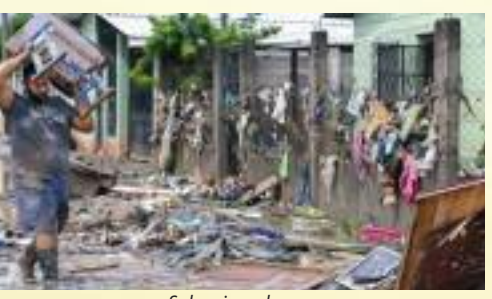
Salvaging a home

MMM and the pastoral team reached out to people affected by the devastation of the hurricanes. They registered 35 families whose houses were damaged or destroyed. Among these, 15 houses needed to be rebuilt. A project supported by Misean Cara will provide for the rebuilding of houses for 4 families assessed to be most vulnerable. Two are headed by elderly persons and 2 are single female-headed,