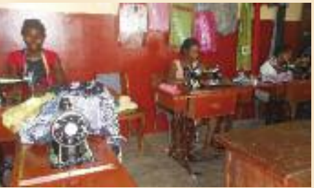
Women learn sewing skills.

Sr. Sylvia commented, 'We wonder what would have happened if we had not gotten the funding.' There were also reductions in health-seeking behaviours and an increase in maternal and infant morbidity and mortality.