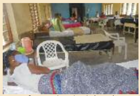
Post-operative patients in the ward

So prevention requires a multi-faceted approach, including the education of communities about the rights of women and girls. With good health and education and access to adequate antenatal care with qualified personnel, labour and delivery will have a positive outcome for both mother and baby.