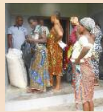
Women waiting for food

Such a comprehensive approach would contribute greatly towards preventing fistula in a rural area and towards achieving safe motherhood and good health for everyone.