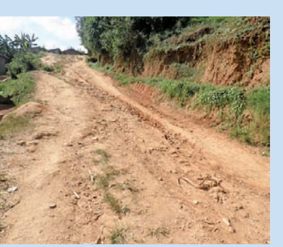
Kirambi road: One barrier to health care

"Sight is a very precious gift that God has given us. Let us be grateful and not take it for granted."