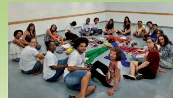
Facing the experience of violence and trauma together

Ito learned that the greeting in African traditional religion is axé . The greeting of the indigenous people of Amazonas, Brazil is awere . Their meaning is similar to the [Hindi] word namaste : 'The God in me recognizes and greets the God in you.'