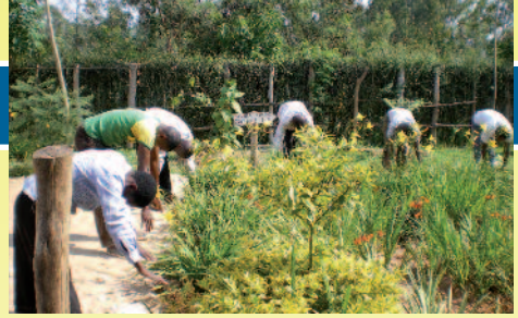
Hearts begin to heal from trauma through Capacitar while gardens begin to grow.

In 2012 KCHDP/Health Centre was one of four programmes chosen by MMM leadership as centres of excellence. The team spirit helped the programme to place fourth in Nyanza District in 2013; third in 2014; and second in 2016. By December 2016, malnutrition in children under five years of age in the catchment area had been reduced to 1.4%.