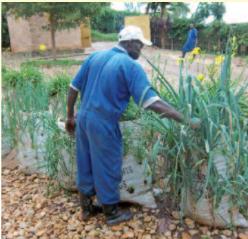
Sack gardens helped to improve nutrition.

Our dream is always for the people to be empowered to take responsibility for their own health. With the government now able to run the programme with the diocese and the local community, after much discernment, we decided that it was time to hand over.