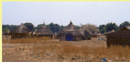
Beginning health care at community level: houses near Eastern Bank