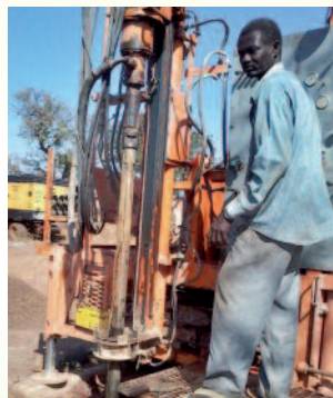
Drilling a borehole to bring much-needed clean water

Since then seven boreholes have been drilled and hand pumps constructed, giving access to clean water to over 3,000 people. Eleven mechanics completed training and are responsible for repairing pumps at Eastern Bank.' Water committees were established.