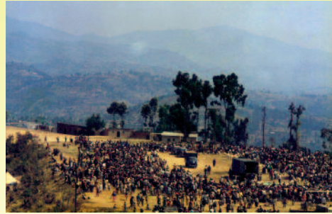
A camp for the displaced in 1994

In October 1996, MMM went to Gikongoro Diocese at the invitation of the bishop. We established our first house in rural Kirambi , where there were historically marginalized groups, poor small scale farmers, orphans and many people living with HIV. After a time of insertion, in May 1997 we took over the running of Kirambi Health Centre. With the support of Trócaire,