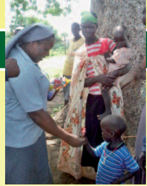
Getting acquainted with the neighbours

Working with the Ministry of Health, the Sisters started immunizations and gave health education in all Eastern Bank divisions. A rakouba (round hut) was built for health education, vaccinations, and nutrition demonstrations.