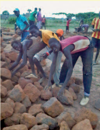
Working together to build a healing centre and a country

In July 2015 the foundation stone of the MMM Healing Centre was laid, with building funds coming mainly from the Malta Mission Fund, HoPE and other donors via our MMM General Mission Fund. Equipment was provided by Maltese donors. Sadly 'construction has been most challenging and unpredictable with fighting breaking out in June 2016.'