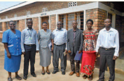
MMM Sisters and staff at the health centre

Through KCHDP/Kirambi Health Centre, many families have improved their lives with capacity development in health and nutrition and with economic empowerment through agriculture.