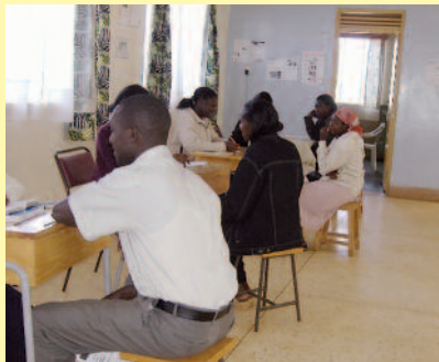
Counselling room at Saint Mary's Medical Centre in Eldoret, Kenya

"I am looking forward to joining other MMMs, MMM Associates, and other people of goodwill on mission."