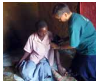
Providing compassionate home care to a woman with cancer