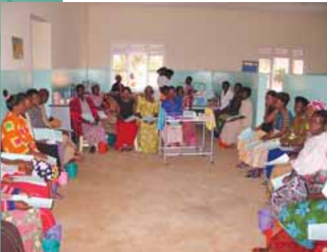
Uganda: Women awaiting operations for VVFs. Thousands are being restored to normal life in their communities.

“...so let this be an MMM virtue: first of all with us must come God's sick poor.”