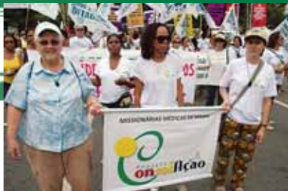
Brazil: Marching against violence and for justice.

MMMs in the 21st century continue to be open to new ministries to reach people on the margins of society, where human needs are greatest.