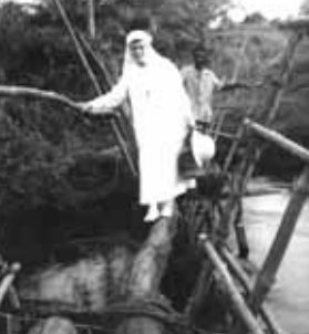
An intrepid MMM crosses a river to care for a woman in need.