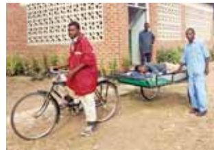
In Malawi: Getting to hospital by bicycle-ambulance.

When HIV treatment became available we worked with governments to facilitate access to antiretroviral drugs.