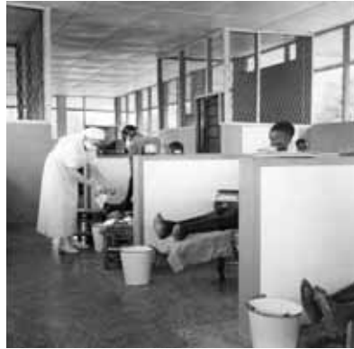
In the early years we provided services for Hansen's Disease in many countries.

In places where dealing with infectious diseases claims much of the health budget, mental health is another area that is often neglected. The issue is compounded by fear and misconceptions and those affected are often put on the fringes of society. Not content with this reality, MMMs trained in the mental health field and began much-needed services in these countries.