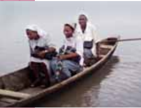
MMMs in Nigeria continue to cross rivers to reach people in need.