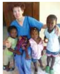
Haiti: Providing relief services after the devastating earthquake.

Our ministry as MMMs has meant offering health services in relief situations. These include responding to natural disasters, famine, violence and civil unrest. We have missioned MMM volunteers to countries such as Kenya, Ethiopia, Haiti, Tchad, and Rwanda. Indeed, this was sometimes the first step in establishing a more permanent presence in these countries – not that ‘permanent’ is an operative word for the Medical Missionaries of Mary! Providing services sometimes means consolidation, sometimes moving out and moving on. We are now preparing for a new ministry in the world’s newest country, the Republic of South Sudan.