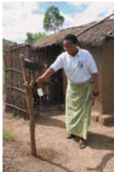
Malawi: Using simple local materials for clean water

When HIV treatment became available we worked with governments to facilitate access to antiretroviral drugs.