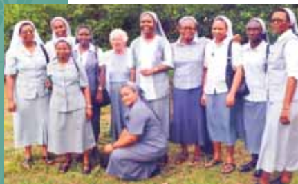
MMMs participating in the School of the Lord's Service

As we move into the 21st century, we do not know what the future holds but we see many signs of new life. This year eight MMMs are taking part in the School of the Lord's Service in Nigeria. Guided by MMM facilitators, these women have the opportunity to withdraw from active ministry for a few weeks and to reflect on their MMM call to serve where “the need for true human development is great, and the people are awaiting the liberating and healing power of the Gospel”.