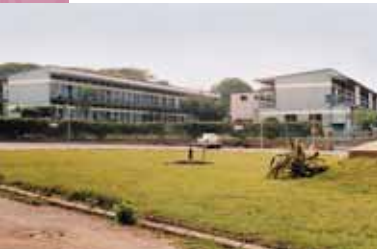
St. Mary's Hospital in Ibadan, Nigeria provides general medical services in an overcrowded urban area.